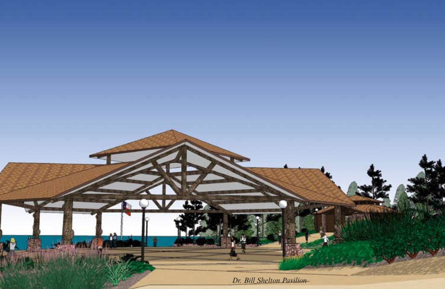
Dr. Bill Shelton Pavilion